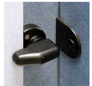
Easily operated thumb turn latches.